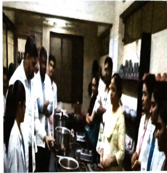
Training on Pathya